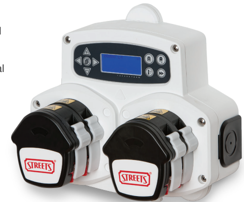
Example: On-premise laundry dosing system, 4 pumps (double pump head)

process needs to eliminate product misuse and waste. In addition, the reporting function allows you to monitor usage efficiency, helping you to control costs and improve sustainability while maintaining the integrity of the fabric.