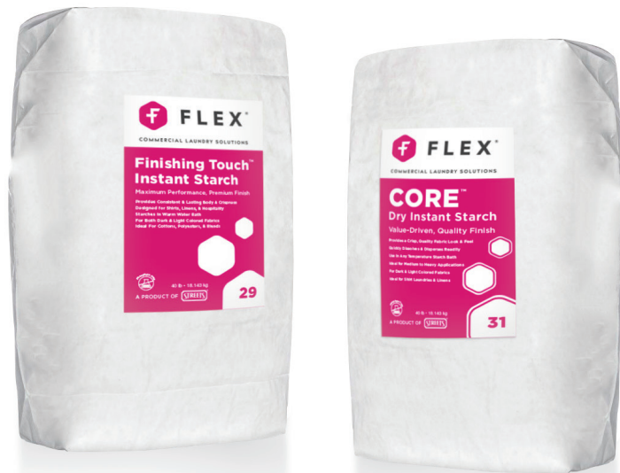
FLEX PRODUCTS COLOR KEY

We offer both an economical and natural starch blend ideal for a wide range of water temperatures, and a premium modified starch-based blend to provide maximum performance in a laundry application. Both products provide a beneficial hand and body to a variety of fabrics and are the perfect finishing agent to add to your specific laundry program.