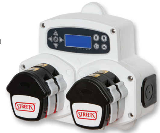
Example: On-premise laundry dosing system, 4 pumps (double pump head)

WITH OUR COMPLETE PACKAGE OF FLEX COMMERCIAL LAUNDRY SOLUTIONS, CUSTOMIZED FORMULAS AND AUTO DOSING, YOU BENEFIT FROM A FIRST-RATE LAUNDRY WASH EXPERIENCE WITH SUPERIOR WASH RESULTS, SIGNIFICANT SAVINGS AND CUSTOMER SATISFACTION.