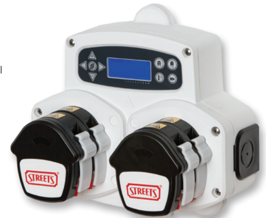
Example: On-premise laundry dosing system, 4 pumps (double pump head)

process needs to eliminate product misuse and waste. In addition, the reporting function allows you to monitor usage efficiency, helping you to control costs and improve sustainability while maintaining the integrity of the fabric.